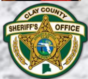
Representative from the Clay County Sheriff's Office